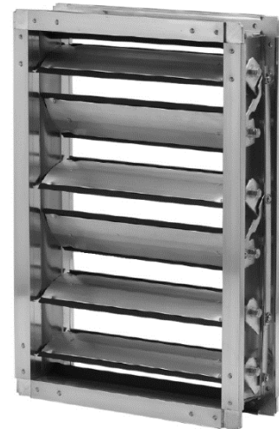
TED40 Economy Insulated Thinline Control Damper